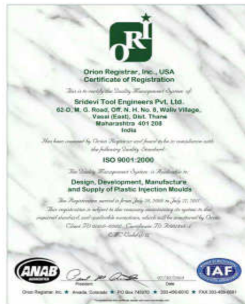
ISO Certified Company

SRIDEVI TOOL ENGINEERS PVT.LTD. is an ISO 9001 – 2000 certified company today.