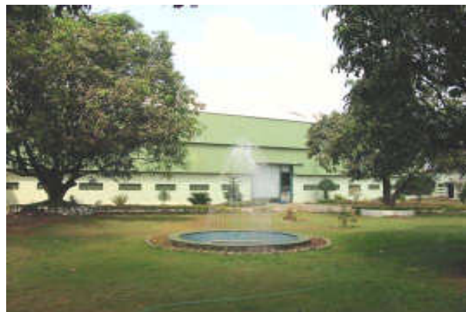
Tool Room near Mumbai, India.

In 1986, SRIDEVI TOOL ENGINEERS PVT. LTD. was the 1 st Commercial Tool Room in India to adopt CNC Machining; a move that gave the company a strong competitive advantage and helped it to grow at a much faster pace than any other tool rooms in India.