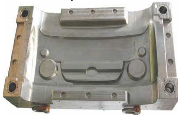
Front Panel Mould

Over the period of 37 years we have acquired good experience of working on Mold Flow Analysis, Reverse engineering, Hot Runner & Cold Runner Moulds, Gas Injection Moulds etc.